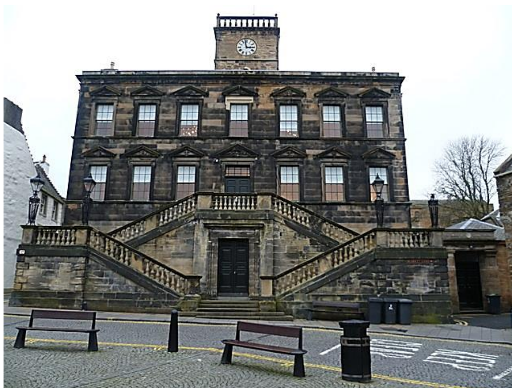
Linlithgow Town House

■ Walk & Talk: Last chance to book one of the few remaining places on our visit to Linlithgow on 22 May. Book now to avoid disappointment: Linlithgow Walk and Talk | Scottish Local History Forum