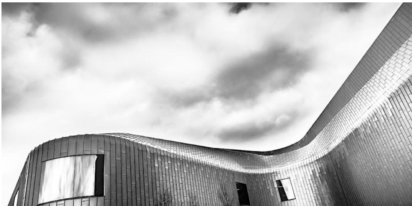
Studies in photography

This conference organised by the Scottish Society for the History of Photography and Supported by Historic Environment Scotland, Society of Antiquaries of Scotland, and Scottish Council on Archives will explore how photography has shaped and recorded the urban architectural heritage of Scotland, Tuesday, 20 May 2025, 9.30am to 4.30pm at The Engine Shed, Forthside Way, Stirling FK8 1QZ. Shifting Perspectives: Scotland's Urban Architecture Through the Lens Tickets, Tue, May 20, 2025 at 9:30 AM | Eventbrite